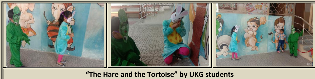
“The Hare and the Tortoise” by UKG students

Students of LKG enacted the age old story of “The Hare and the Tortoise”, coming out with the beautiful moral emphasising “Slow and steady wins the race”.