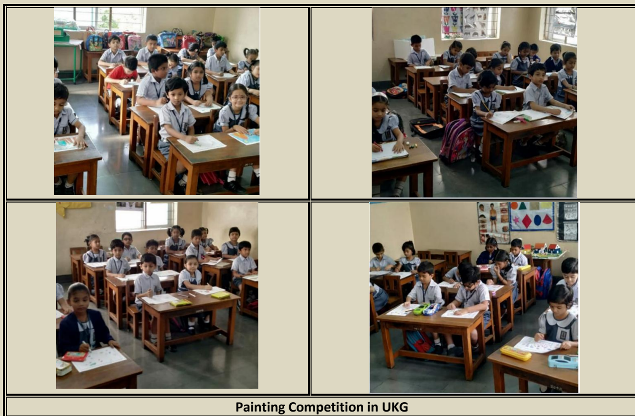
Painting Competition in UKG

UKG students had a painting competition amongst themselves. The topic given to them was “Seasons”. They tried to imagine the umbrellas, raincoats etc for the rainy season, woollen clothes for winter, and of course Ice creams for the summer season, and let their imagination flow. Good flow of Creativity!!