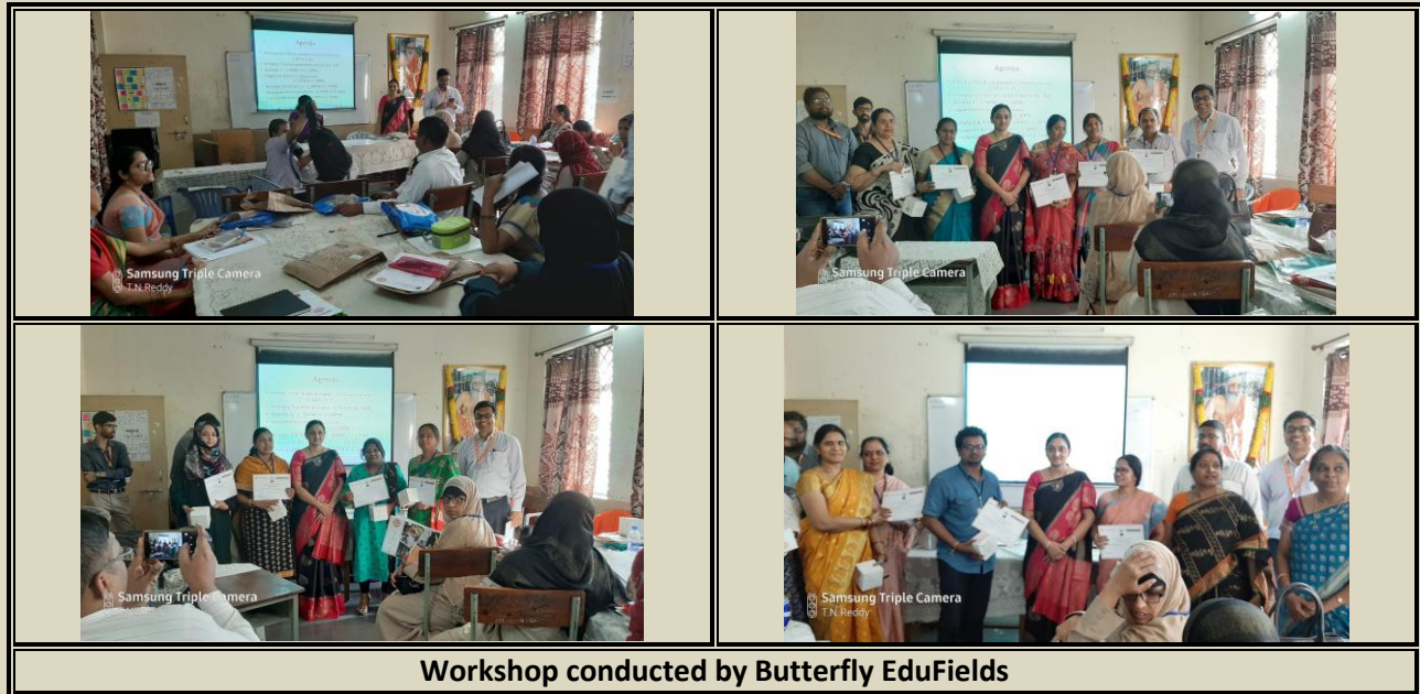
Workshop conducted by Butterfly EduFields