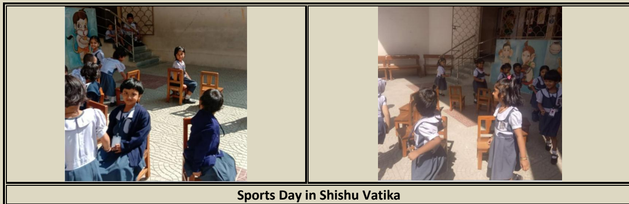
Sports Day in Shishu Vatika