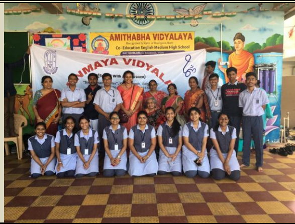
Students of Senior Secondary Wing, accompanied by a few teachers visit an orphanage