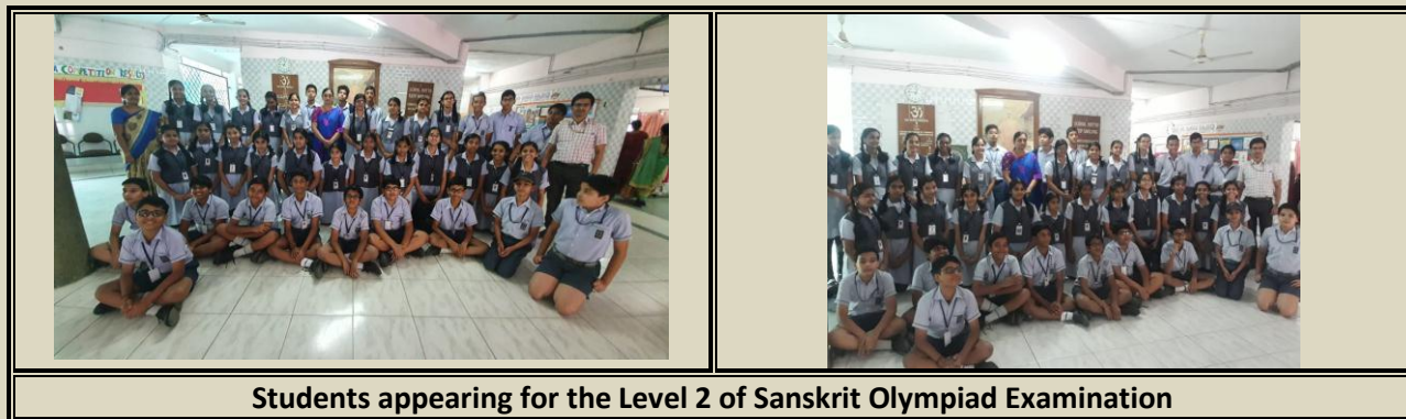
Students appearing for the Level 2 of Sanskrit Olympiad Examination