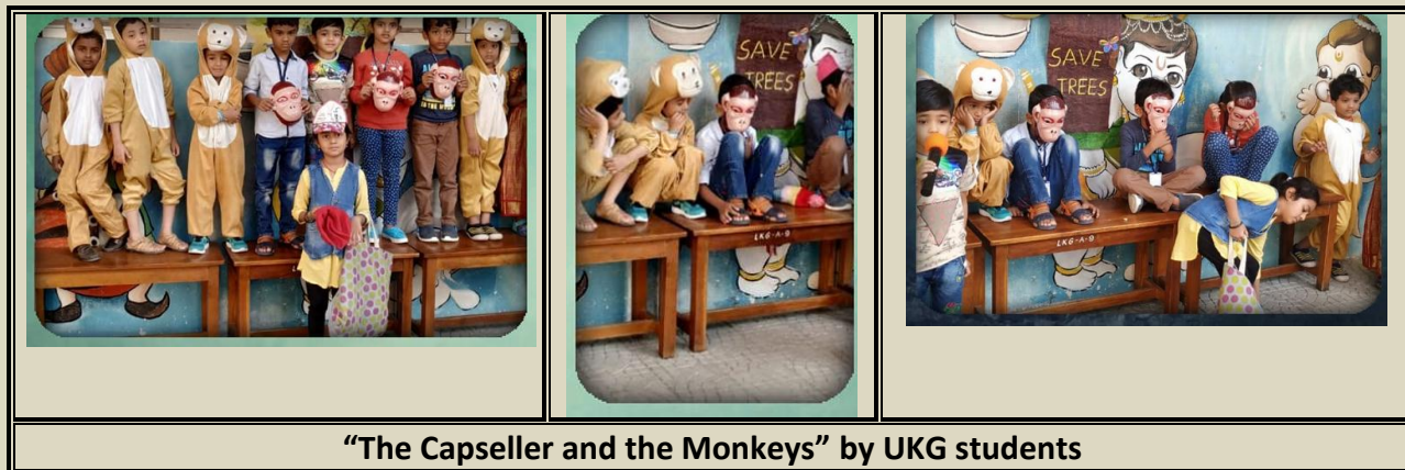
“The Capseller and the Monkeys” by UKG students

Students of UKG enacted this play during their assembly time and had a great time, learning the story and listening to the morals.