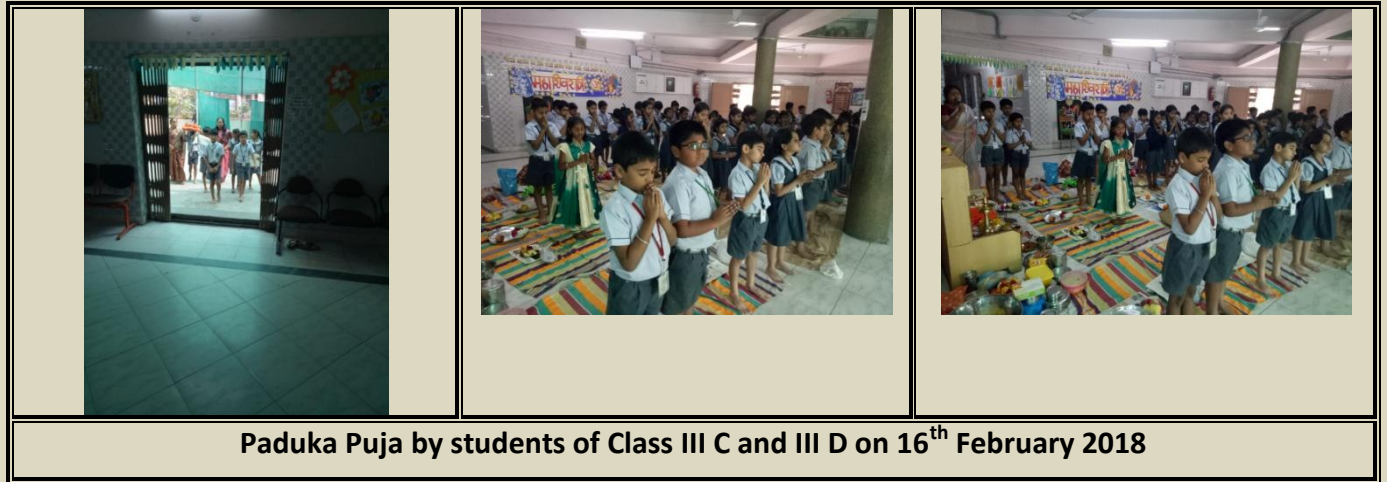
Paduka Puja by students of Class III C and III D on 16 th February 2018