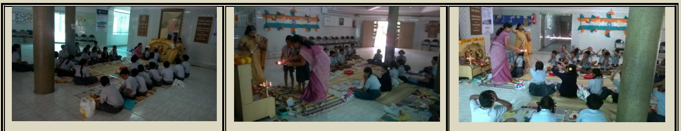
Paduka Pujan by students of Class IV D on 1 st Feb 2018