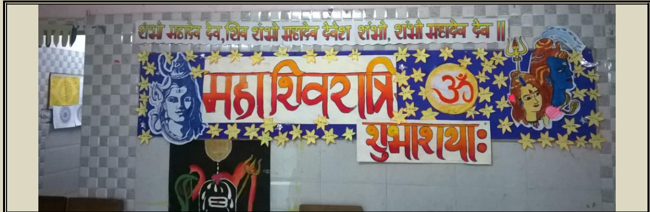
Lobby Board Decoration in the Ground floor on the occasion of Mahasivaratri

Lord Jagadeeshwara at Saandeepany Kailas, where the premises of our Vidyalaya is, is the presiding Deity at Dhyana Nilayam. Mahashivratri was celebrated with great devotion and splendor on the 13 th of February 2018. Archanas, and pujas including Shiva-Parvathi Kalyanam formed part of the celebrations. Throngs of devotees flocked to the temple on this day in order to have darshan of the Lord.