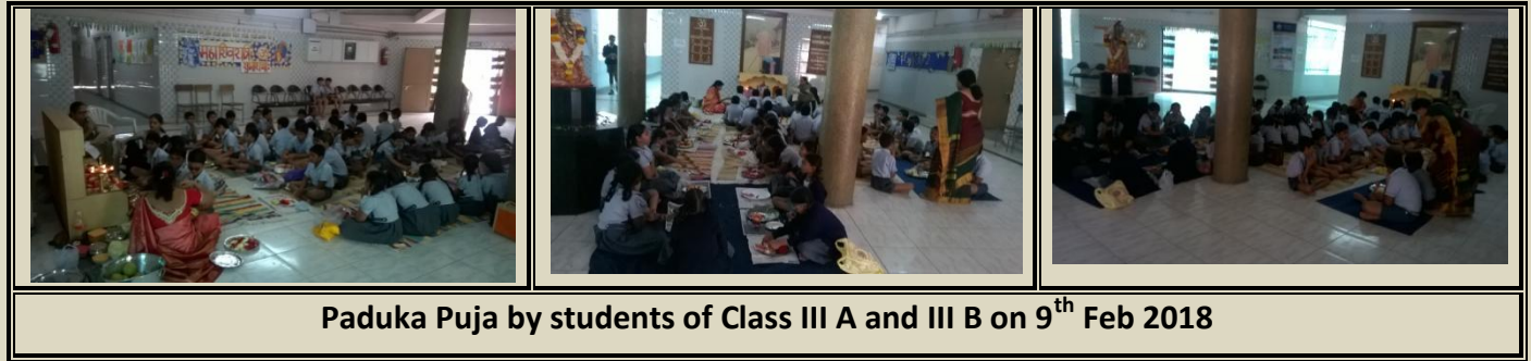
Paduka Puja by students of Class III A and III B on 9 th Feb 2018