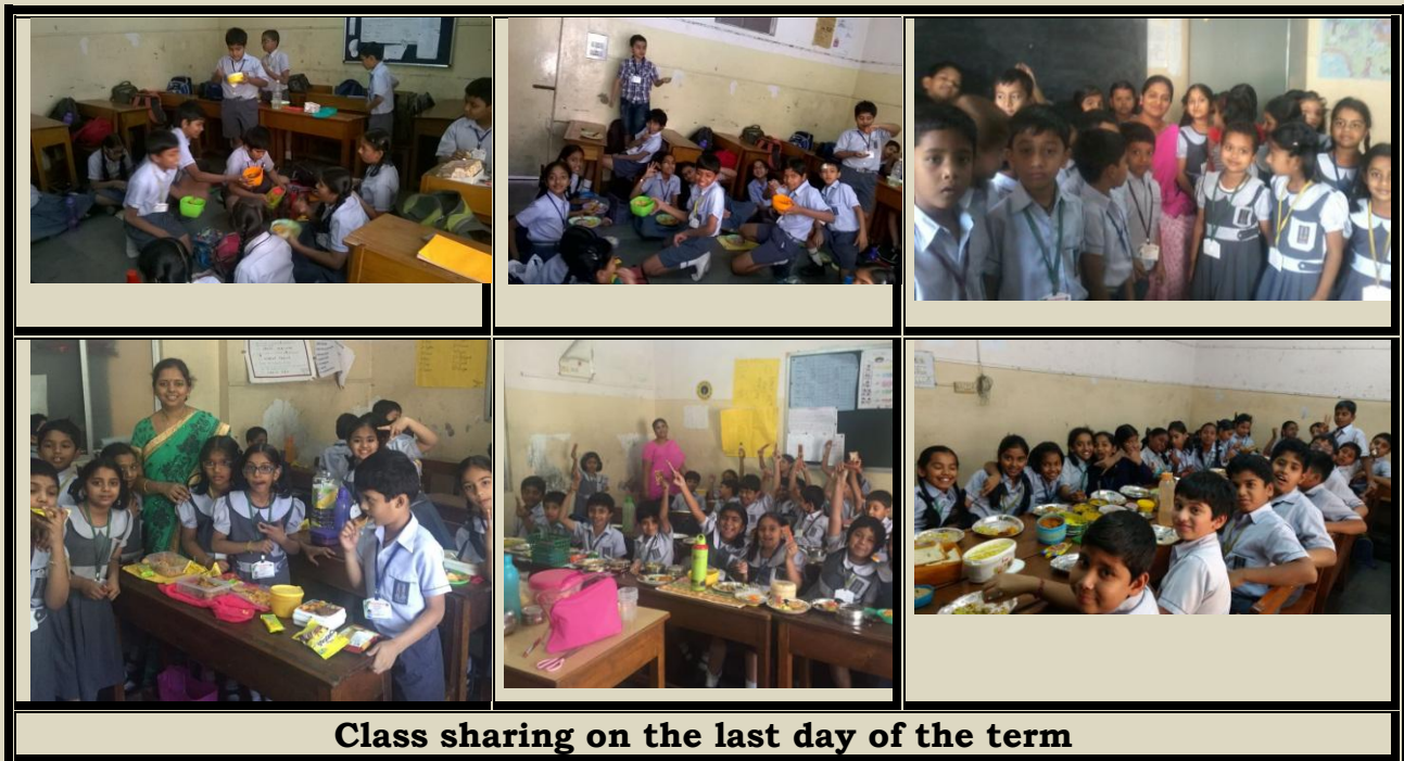
Class sharing on the last day of the term

Students had the last working day for the academic year 2016-17 on 3 rd March, prior to the commencement of SA-2 exams. They had class sharing lunch during an extended lunch break. They enjoyed deliciously cooked home made food , brought by their classmates.